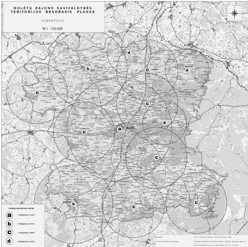
Fig. 3. Hierarchy of locations of the district approved by the Municipal Council of Molėtai district

socio-economic development of the whole region. Concentration of service infrastructure in local centres should narrow the gap between towns and rural areas.