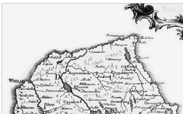
Fig. 1. Historical map of the Livonian coast, 1772 (Geographica Gubernii...)

A traditional coastal building unit was a fisherman's homestead composed of a cluster of several structures, namely, a dwelling house, barn, fish cellar, pigsty, net hut, fish smoking shed, cattle shed, bathhouse, root cellar and sum-