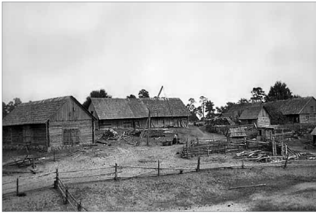
Fig. 4. A typical fishermen's homestead in 1912 (Baķu homestead. Mēlnsils.)