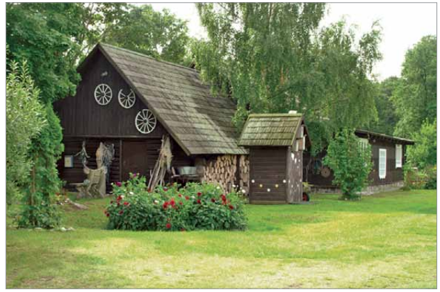
Fig. 5. A contemporary homestead on the Livonian coast